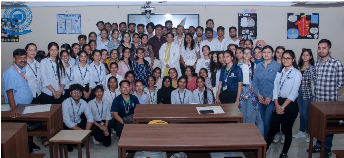
Figure:2 Participants with Resource person